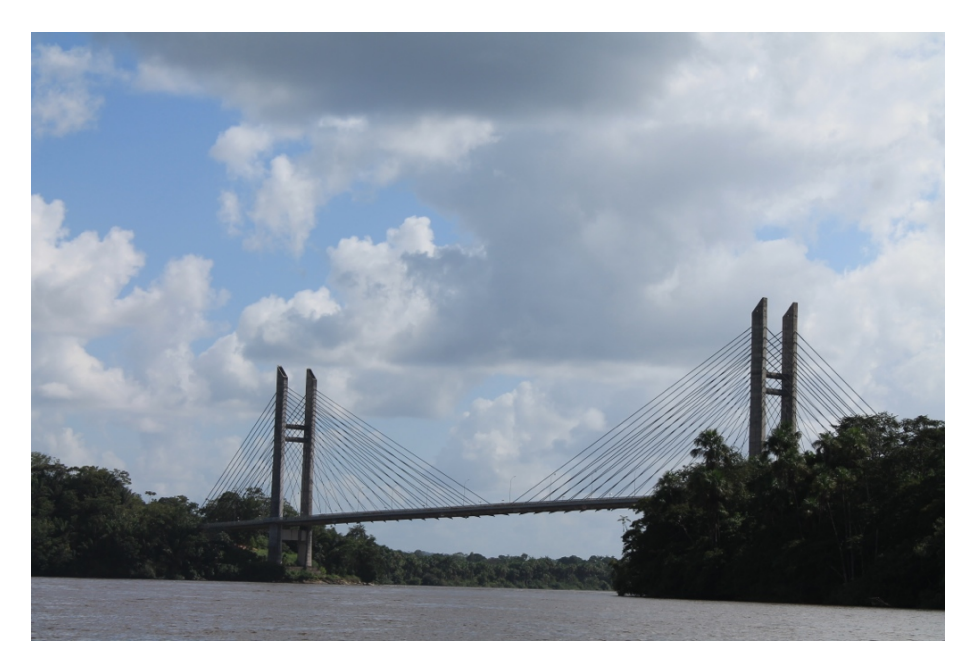
Fig. 4: Oyapock River Bridge.

although égalité is often referred to when legitimizing this status, the French state is far from providing equal opportunities for its citizens on the other side of the Atlantic, as became evident in the frustration that sparked the 2017 general strike and social movement. This complex nesting—French Guiana as France's and the EU's poor backyard in Latin America and French Guiana as a prime destination for people without prospects from neighboring Brazil and other countries—provides a difficult but highly innovative field for future research. In particular, the recent opening of the Oyapock River Bridge (see Fig. 4) poses a variety of questions to social scientists interested in the socio-spatial transformations at a border whose fluidness seems to turn more and more into fixedness. Such research is necessary in order to continue to draw new maps of the European Union and the world more generally.